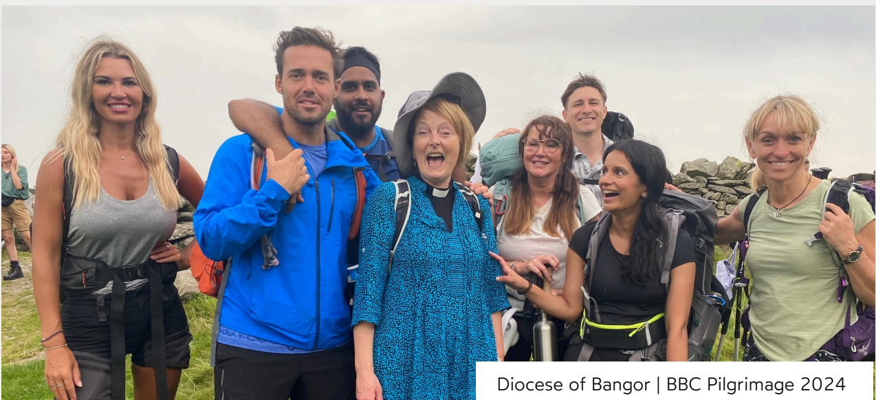
Diocese of Bangor | BBC Pilgrimage 2024

We welcome you to join us in this transformative mission, as we navigate the challenges of our time with faith, dedication, and a commitment to worship, growth, and love.