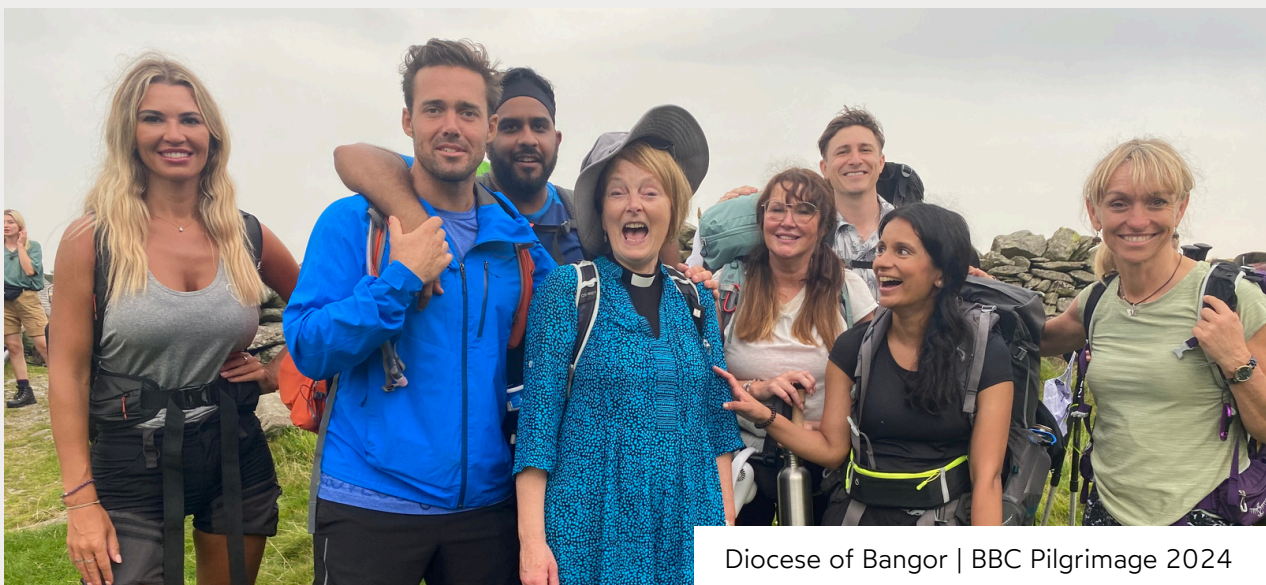
Diocese of Bangor | BBC Pilgrimage 2024

We welcome you to join us in this transformative mission, as we navigate the challenges of our time with faith, dedication, and a commitment to worship, growth, and love.