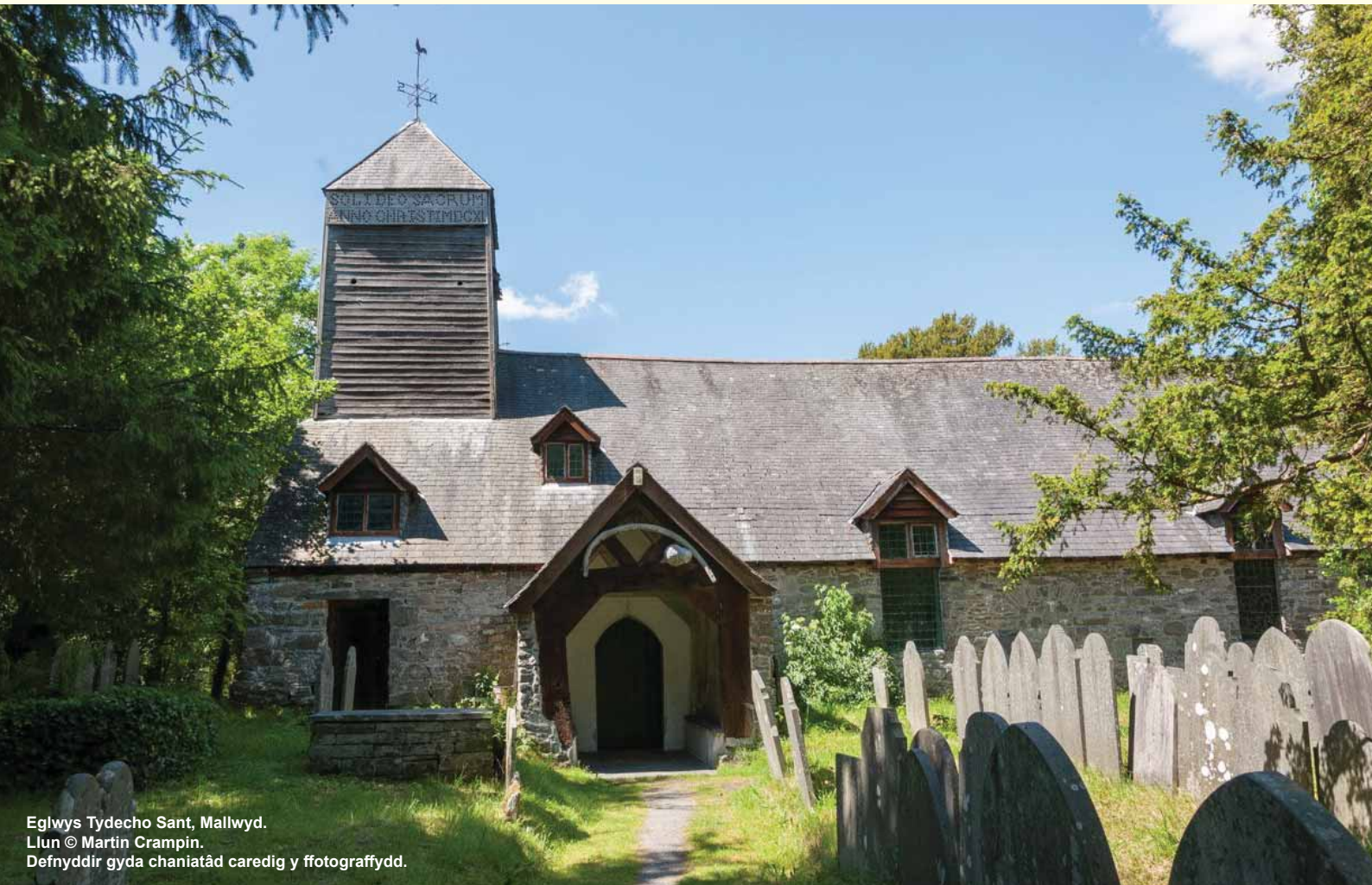
Eglwys Tydecho Sant, Mallwyd.

https://us02web.zoom.us/webinar/register/WN_3aEfmZE0TOCnmnu7Gm0ftw