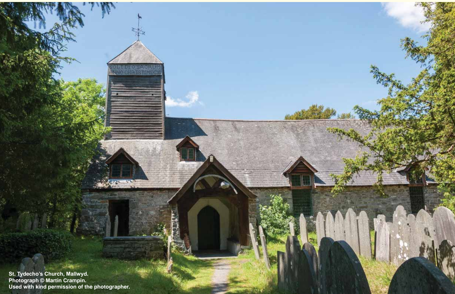
St. Tydecho's Church, Mallwyd.

https://us02web.zoom.us/webinar/register/WN_3aEfmZE0TOCnmnu7Gm0ftw